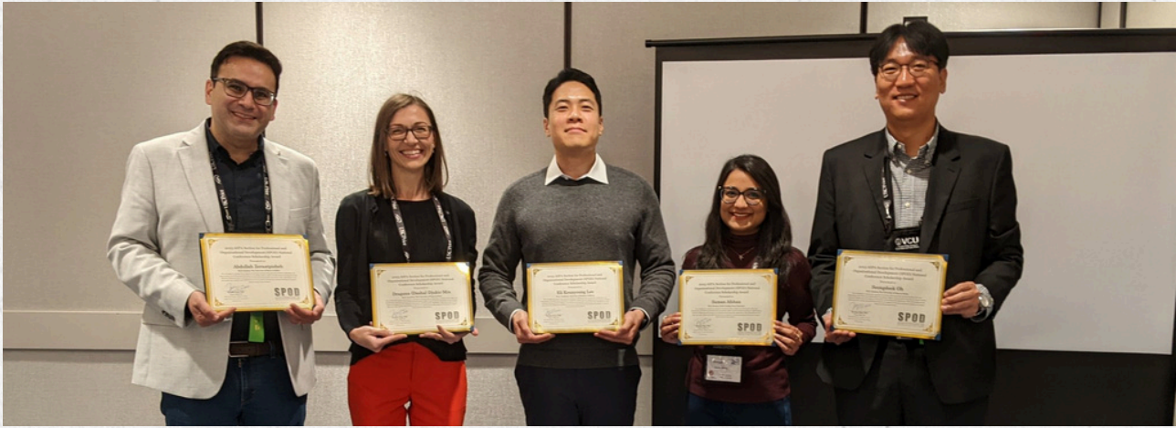
The five winners of the SPOD Annual Scholarships this year.