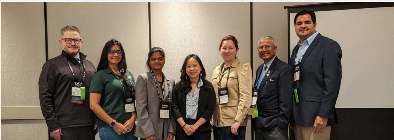
SPOD Leadership Team