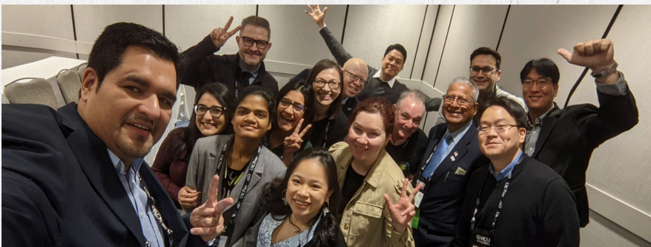
SPOD Business Meeting